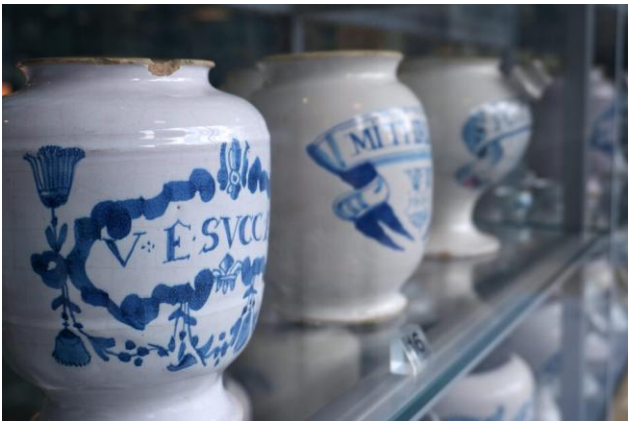
Ref The Pharmaceutical Journal 26 th March 2025